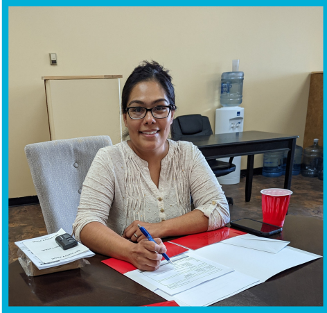
Velen and her family closed on their home and moved in September of 2022!