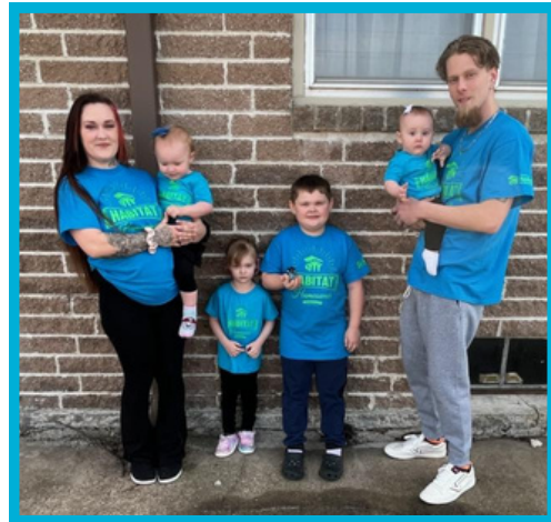
The Deklvas Family