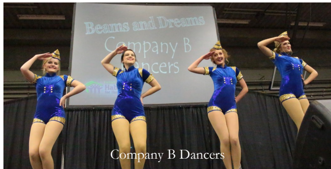
Company B Dancers