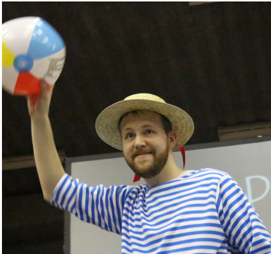
Mr. Habitat 2016

Seeking to put God's love into action, Habitat for Humanity brings people together to build homes, communities and hope.